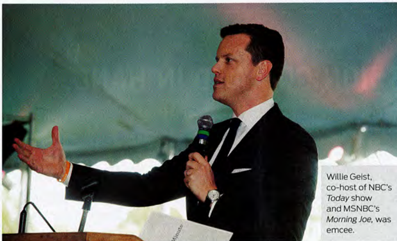
Willie Geist, co-host of NBC's Today show and MSNBC's Morning Joe , was emcee.